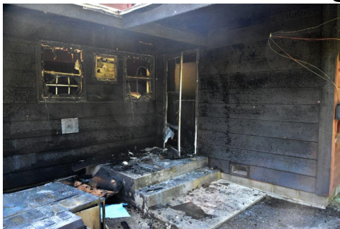
West wall closest to The Point