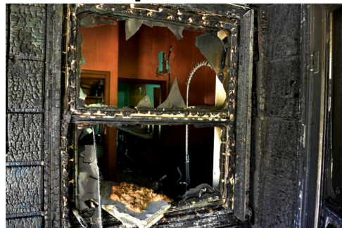
Looking into the dish room

On the evening of July 4th, a fire damaged the dining hall at the UCC's Pilgrim Point Camp in Alexandria, MN. While there were no serious injuries, it will take some time and energy to restore full service at the camp. In the meantime, consider attending a fundraising dinner and concert at Robbinsdale UCC on August 8th at 6pm. Click here for more information and to RSVP.